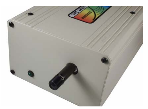
SMA-Coupler and Lens-QCol Directly on a Spectrometer