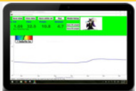
Simple user interface with %Fat, Fiber, Protein, & Moisture Displayed

ChemWiz-ADK-CGBO and ChemWiz-ADK-Case-CGBO (Coarse Grains, Beans, Oilseed)