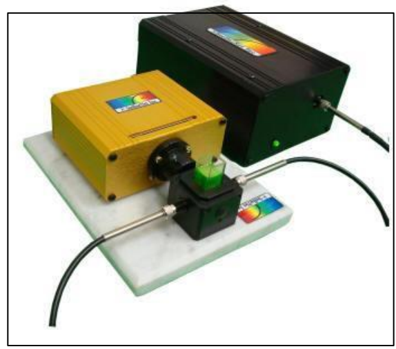
Fiber Optic Sampling Accessories

Liquid Samples are measured using the CUV-F liquid fluorescence fixture which includes a larger base to accommodate the SL1-LED excitation source. This also includes a 600 micron Y-fiber for dual-90° emission pick-up resulting in a 2x enhanced signal collection.