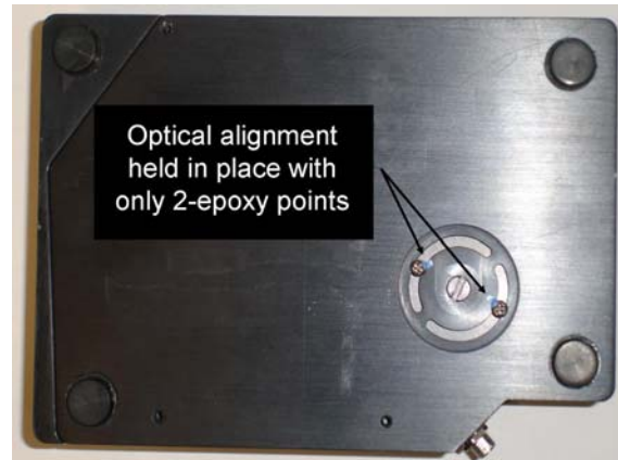
Figure 1: View of the bottom of an OOI HR4000 showing the rotating optical bench held in place with epoxy (blue).

The first area where StellarNet stands out is our ruggedness and shock-proof durability: there are no electronics in the optical bench and our detector is bolted to the exterior of the bench as apposed to being placed in a socket. Our units are then further ruggedized by placing the spectrograph in an extruded aluminum enclosure. In contrast, Ocean Optics (OOI) a well known maker of miniature spectrometers, uses delicate enclosures for both optics and electronics which are very sensitive to shock and damage. More, their optical alignment assembly is held by only two small epoxied points, which are exposed at the bottom of the unit. While it's true that their units may be portable, they are not rugged and should not be dropped.