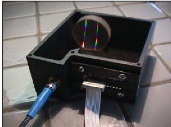
Figure 2: Optical bench of permanently aligned EPP2000C concave grating spectrometer.

StellarNet prides itself on being an industry leader delivering high quality and performance at a low price. For example, we offer a low cost, flat-field spectrometer (EPP2000C) which consists of an aberration corrected concave grating that delivers uniform resolution across its range. It also has a securely mounted detector with no mirrors for the lowest possible stray light and superb spectral imaging. There are no moving parts for portable applications that require vibration tolerance and permanent alignment. This instrument provides the same grating you would find in a high-end spectrophotometer and is without doubt a portable Cadillac instrument. With a concave grating there is no need for mirrors and this minimizes stray light that is crucial in most spectroscopy measurements. What should be noted is that the resolution is constant throughout the entire spectrum as opposed to the typical Czerny-Turner design where only the center wavelength can be in focus. Lastly, the grating provides aberration correction for superb optical imaging into the detector array and creates extreme sensitivity (x2 higher signal) below 400nm “like no other”.